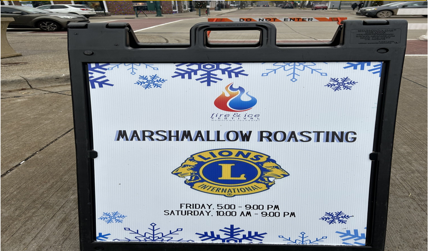
Signs provided by the Oakland County Parks Department